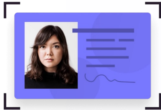
Capture and auto-classify identity documents

Combine forensic and biometric data to verify with confidence