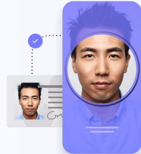
Get definitive verification results in seconds